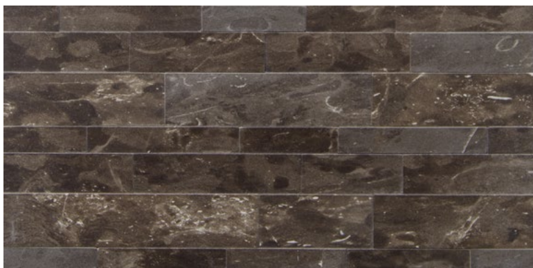
mix free length - Fossil